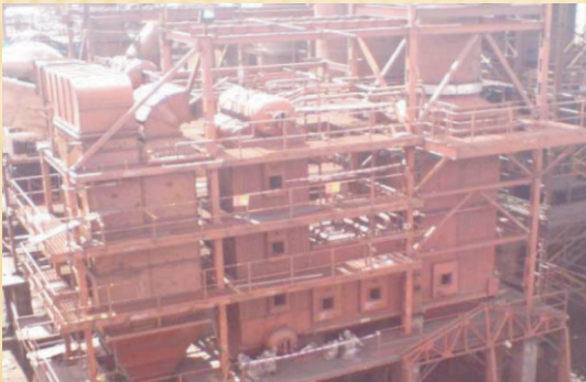
Waste Heat Recovery Boiler (Kiln Exhaust)