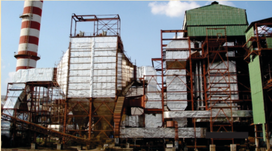
Bagasse/Coal fired Travelling Grate Boiler