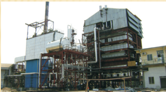
Coal fired Fluidised Bed Combustion Boiler