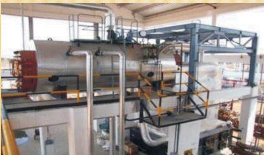
Multi Fuel Fired Compo Boiler